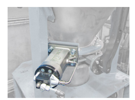
PKL 740 for loosening bridge formations