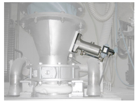
PKL 190 for improving material flow