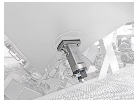
PKL 740 for cleaning bunker walls