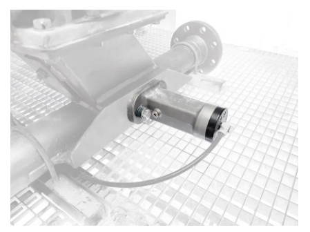
PKL 450 for loosening adhesions

As soon as compressed air is supplied to the VAC, it sucks Vacuum mounts of the VAC series are used for fast attach- firmly, thus ensuring a force-locked connection between the impactor and the subsurface. ATEX-compliant mounts