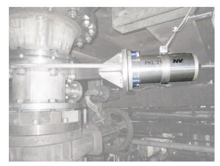
PKL 2100 for loosening adhesions